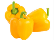
ITEM #: 148309