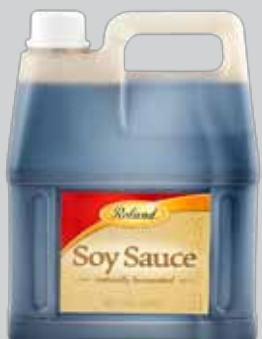
Roland® Soy Sauce item #87088 4/1 Gallon PET Jug Naturally Fermented No MSG Kosher

Roland® Soy Sauce is naturally fermented for a rich, umami flavor and dark brown color. Its great viscocity that is not too thin or too thick, makes it a great addition to stir-fries, marinades, or used as a condiment.