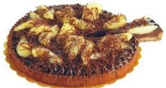
Chocolate Cream Pear Crostata #50430 (1/49.4 oz.)