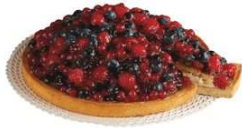
Mixed Berry & Chantilly Cream Cake #50400 (1/49.4 oz.)