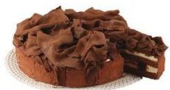
Black Forest Cake #50450 (1/42.3 oz.)