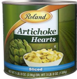
#40506 Artichoke Hearts, Sliced (6/3 kg.)

Ask us about potential Quartered Artichoke Heart alternatives.